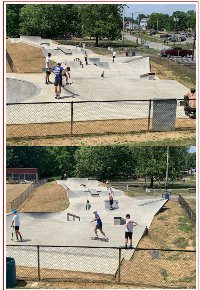
After years of planning, the Zelienople Memorial Skate Park is finally complete.

We hope that the pool can provide some relief and enjoyment during these scorching days of summer.