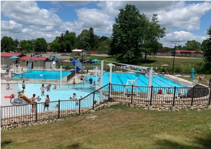
The Zelienople Community Pool is now open to members and residents from the Zelienople, Harmony, Jackson, and Lancaster communities only. Proof of residency is required.

The Community Park Board would like to thank all of its residents and the surrounding communities as we adapt to the ever changing directives resulting from COVID-19.